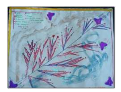
Figure 3: Lily's Life Mind Map

"Lily got to know how life was during childhood days"